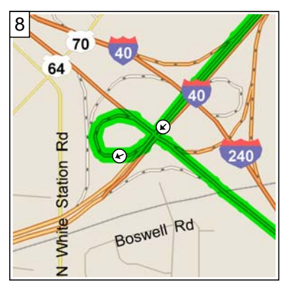
11:51 AM 206.9 mi At exit 10A, take Ramp (RIGHT) onto I-40 for 0.3 mi towards I-240 / Jackson Miss