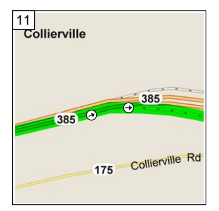
12:11 PM 224.4 mi Turn RIGHT onto Ramp for 0... mi towards Byhalia Rd