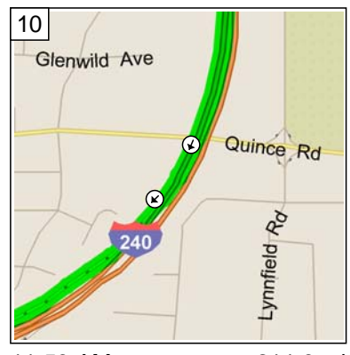
11:56 AM 211.9 mi At exit 16, take Ramp (RIGHT) onto SR-385 [Nonconnah Pky] for 12.5 mi towards TN-385 / Nonconnah Pky