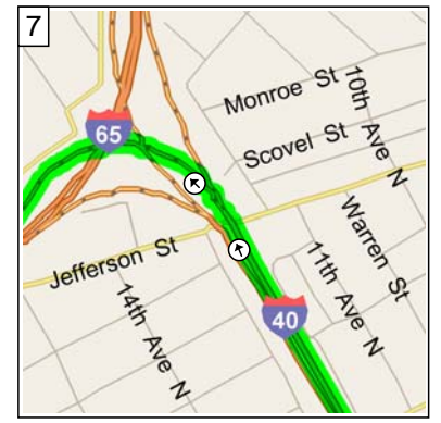
9:11 AM 9.1 mi At exit 208, take Ramp (LEFT) onto I-40 for 197.8 mi