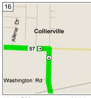
12:16 PM 227.9 mi Turn RIGHT (South) onto Progress Rd for 0.3 mi