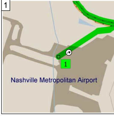
9:00 AM 0.0 mi Depart Nashville Metropolitan Airport on Local road(s) (East) for 0.2 mi