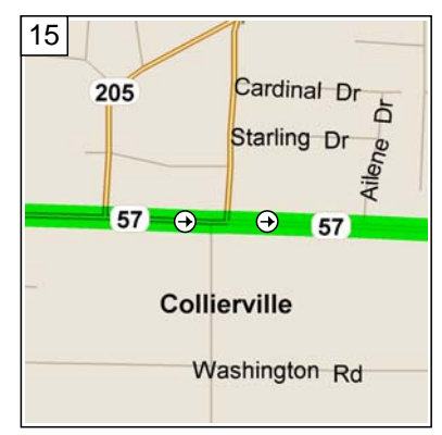
12:15 PM 227.6 mi Keep STRAIGHT onto SR-57 [E Poplar Ave] for 0.4 mi

12:13 PM 225.9 mi Keep STRAIGHT onto SR-57 [W Poplar Ave] for 1.6 mi