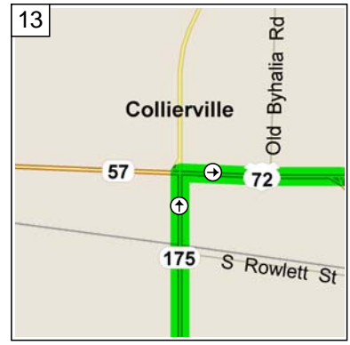
12:12 PM 225.7 mi Turn RIGHT (East) onto US-72 [SR-57] for 0.2 mi