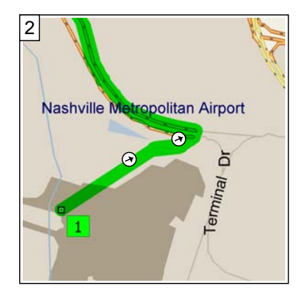
9:00 AM 0.2 mi Road name changes to Terminal Dr for 153 yds