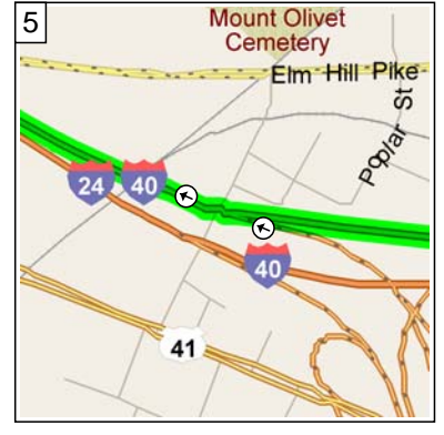
9:05 AM 4.1 mi Road name changes to I-24 [I-40] for 1.7 mi