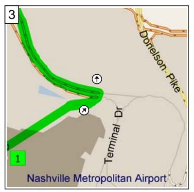
9:01 AM 0.3 mi Bear LEFT (North) onto Ramp for 21 yds