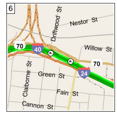
9:07 AM 5.8 mi At exit 83A, road name chang... to I-40 for 3.4 mi