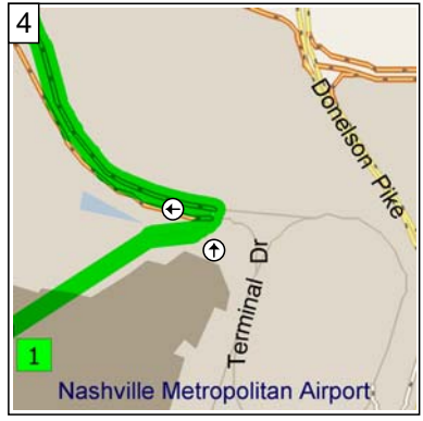
9:01 AM 0.3 mi Take Ramp (LEFT) onto I-40 for 3.7 mi