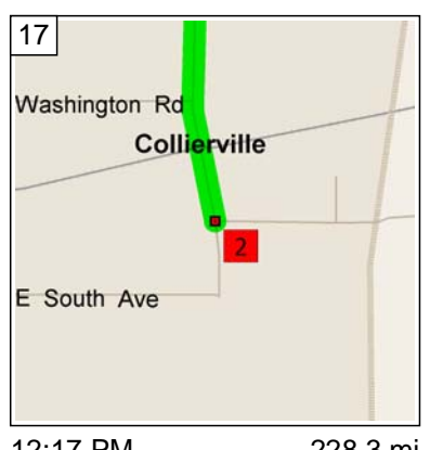
12:17 PM 228.3 mi Arrive 185 Progress Rd, Collierville, TN 38017